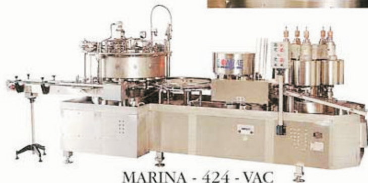
MARINA - 424 - VAC